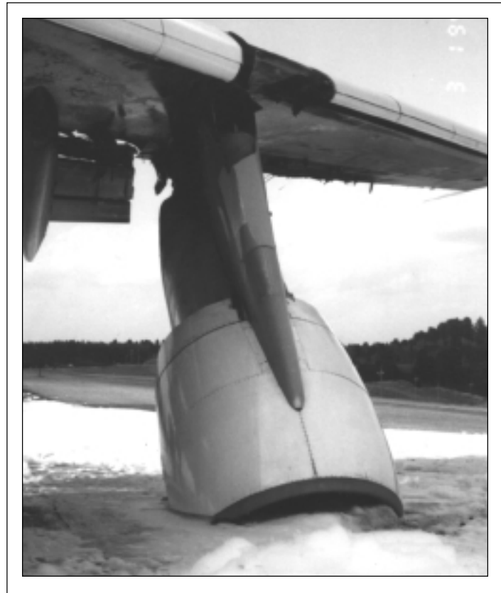
Northwest Airlines Boeing 747's No. 1 engine and pylon rotated downward during the landing roll-out. The lower forward part of the engine cowling was ground away by dragging on the runway.